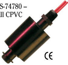
LS-74780 – All CPVC

Particularly well suited for rough service. Ideal for use in chemical and plating applications.