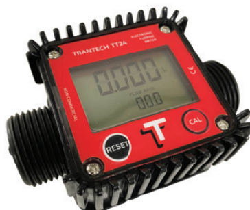
TT24 - Turbine meter