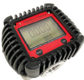
TTMGM-B - Trantech mini gear meter